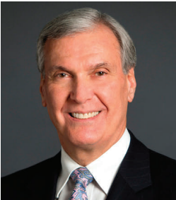
Leonard Fornella Shareholder Litigation Energy & Natural Resources Employment & Labor