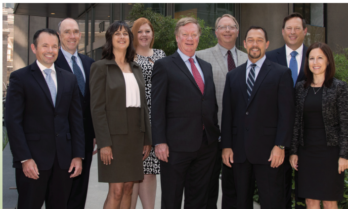
Forsberg & Umlauf, P.S., Super Lawyers 2017

We take pride in providing high-level professional service to a wide range of local, national and international clients while maintaining a reputation of excellence with judges, other lawyers, and clients. We help solve our clients' civil litigation needs, including trials, hearings, appeals, arbitration, settlement and mediation with experience, passion, dedication and hard work. Our firm is committed to providing an early evaluation in each case. We prepare litigation management plans and budgets in every case. More importantly, we discuss these plans and budgets with our clients to obtain approval and to ensure we are meeting their goals and needs.